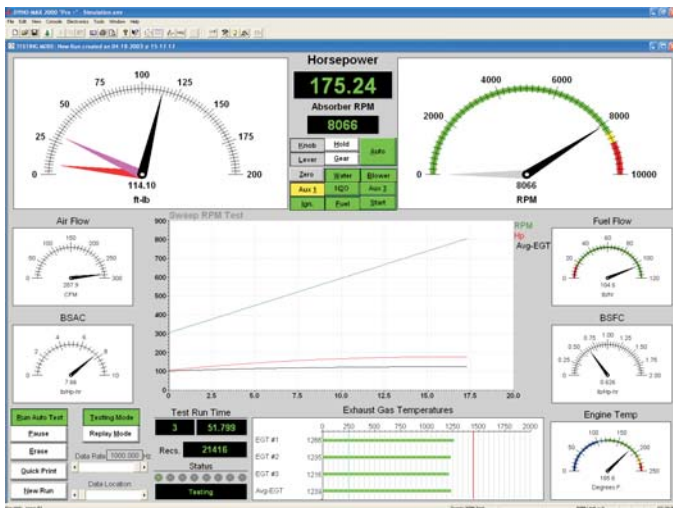
Optional DYNO-MAX 2000 to PC interface software.

Reads TRUE crankshaft Hp using precision full-bridge temperature compensated strain gauge to directly measure torque, instead of estimating from hydraulic pressure or inertial acceleration. Only crankshaft dynamometers isolate Hp from the inconsistencies of belt efficiency, track tension, windage, etc. to provide the repeatable data serious developers need to compare against the OEM's and other engine builders' results.